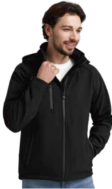
MX BLACK MALE MX3511